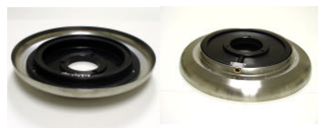
260 X 175mm