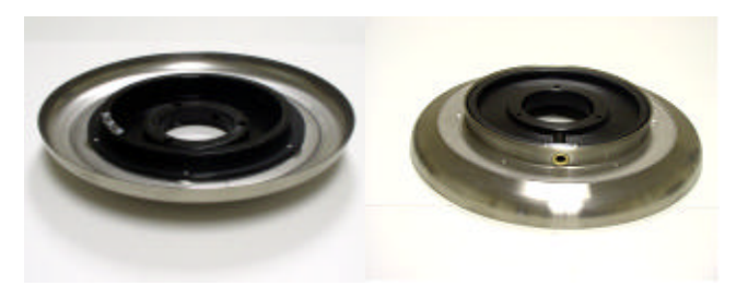
260 X 160mm