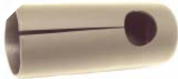
EE380201 Cover, Safety for ICBT Creel Spring 94209901 $2.32